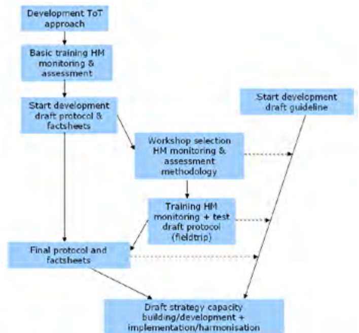
Figure 1. Schematic development process component 2 with relations between various activities and deliverables.

The monitoring component of the project delivered a Training of Trainers programme (17 persons trained) and a guideline describing the process of data collection, the preparation and execution of field surveys, the application of protocols and factsheets and an implementation strategy.