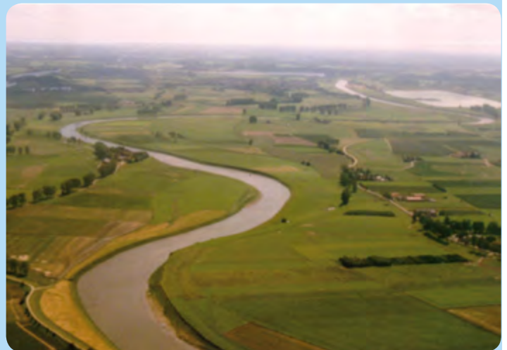
Katia Nagels Agency for Nature and Forests

This project spans Flanders and the Netherlands, she emphasised the importance of collaboration where rivers do not 'recognise' our borders. She also asked for better join up between European Directives influencing water management and improving nature conservation. Her work looked at creating natural riverine landscapes, including replacing gravel beds in the rivers, removing engineered bank protection and creating wet woodland and flower rich grasslands in the floodplain. The river had become degraded from decades of intensive agriculture, gravel extraction and separation of the river from its floodplain.