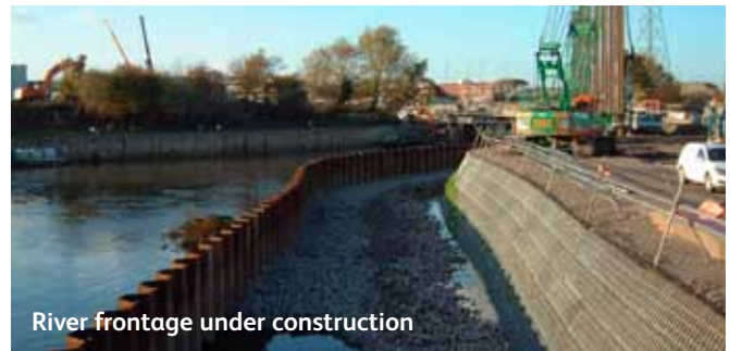
River frontage under construction