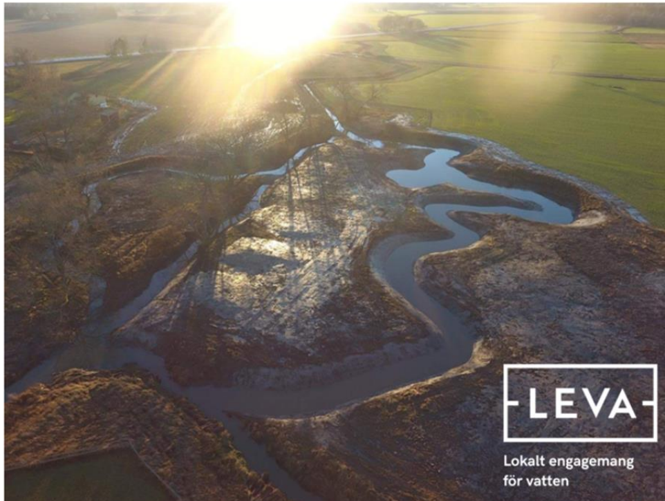
Färdigrävd våtmark hösten 2020.