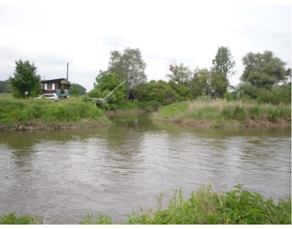
Austrian fishermen cabin at the Thaya and a still connected meander