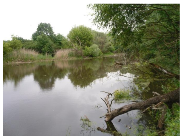
Cut-off meander on Czech side