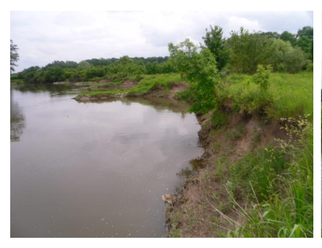
Czech banks of ther Dyje/Thaya river bed