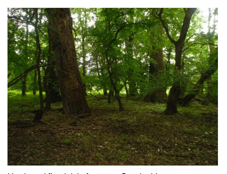
Hardwood floodplain forest on Czech side