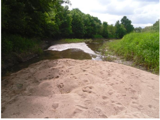
Upper end of meander 18: Filled up with sediments after its reconnection