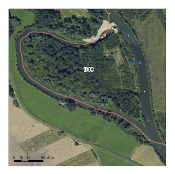
Thaya river (at right) and the targeted meanders 5 and 18