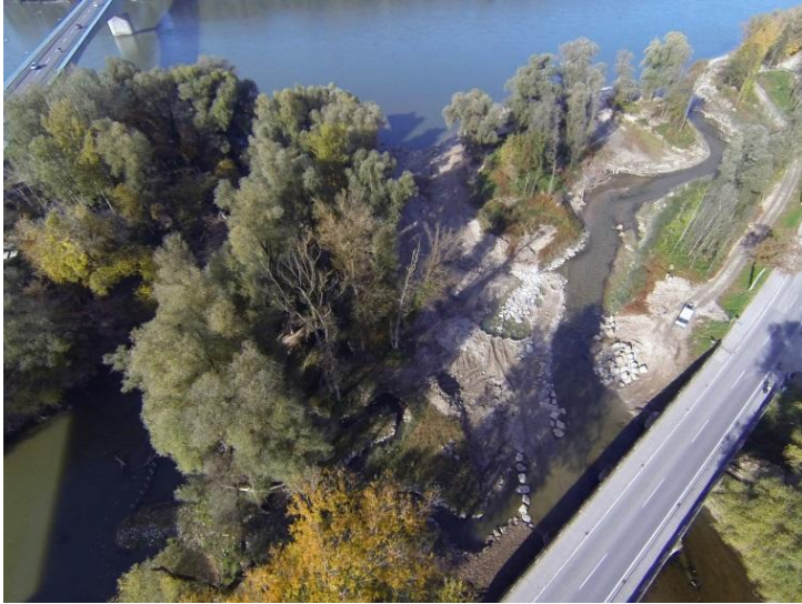
The rebuilt mouth of Pielach river and side-arm serves at Restoring fish migration from/into the Danube