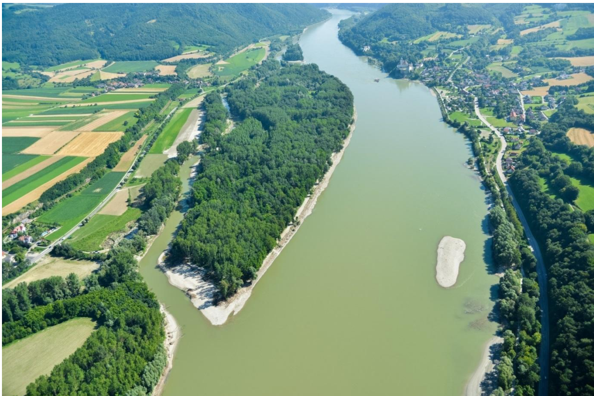
Top and below: The reconnected Schallengersdorf-Grimsing side-arm system after removing bank protection (riprap) and low-water regulation barriers