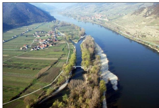
The reconnected Danube side-arms and flood Plain island at Rührsdorf.