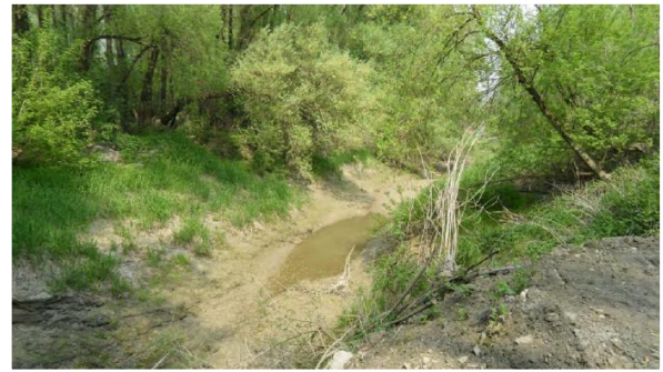
Silted-up side-arms prior to restoration works.