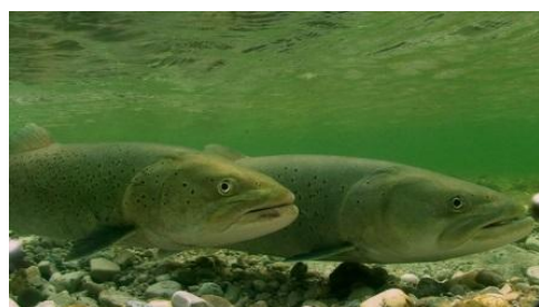
Danube salmon at spawning site