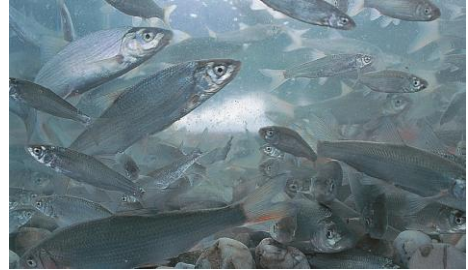
Common nase