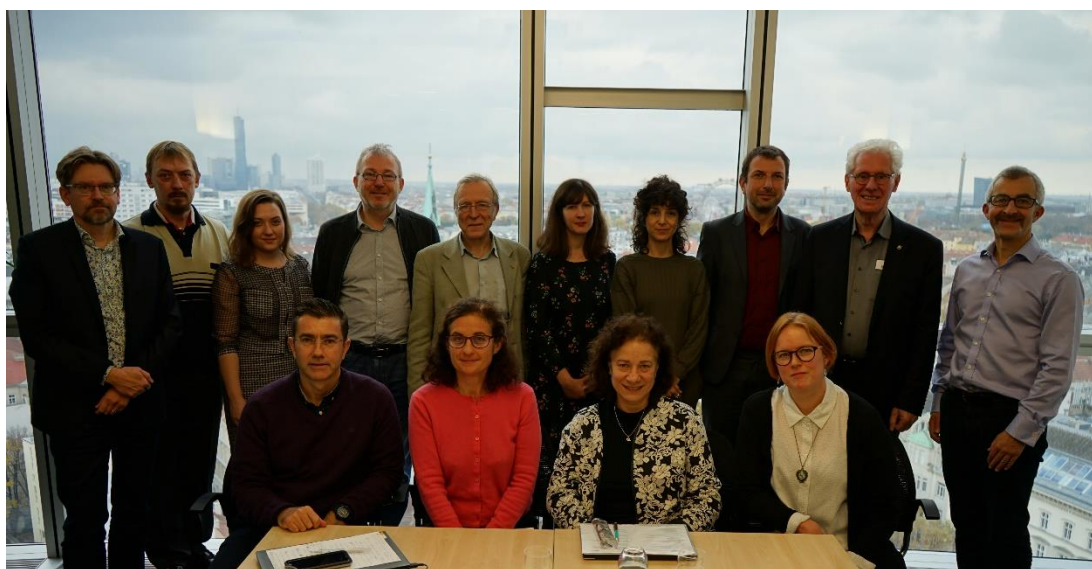
Participants of the ECRR General Members Meeting on 18/19 November 2019, International Association of Water Service Companies in the Danube River Catchment Area / World Bank, Vienna, the Austria.