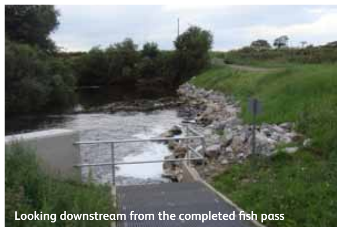
Looking downstream from the completed fish pass