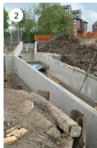
(1) Concrete U-channel of the fish pass during construction; (2) U-channel once completed