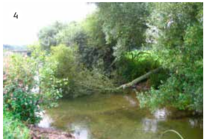
(1) Bed reprofiling; (2) Bank reprofiling; (3) Riffle creation; (4) Bed raising