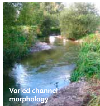
Varied channel morphology