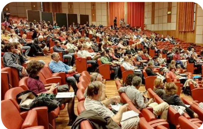
Plenary session at the 3rd Italian River restoration Conference organized by CIRF in Reggio Calabria in November 2015.

Currently CIRF is the reference organisation in Italy on river restoration and sustainable river management, linking research with practice and networking with other technical-scientific association and both national and local public institutions. Key issues tackled include assessing effects of management alternatives of river systems, fluvial conflict resolution, ecosystem services related to healthy rivers, identification of best practice in hydromorphological management and restoration of rivers. In Italy CIRF is also acknowledged as a relevant organization for orienting the implementation of pertinent policies supporting public authorities and practitioners and through targeted dissemination. CIRF delegates are regularly invited to institutional tables for discussing issues related to policies, regulations and guidelines on sustainable river management.