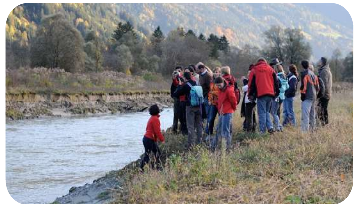
Intranational study tour on "Incised rivers and morphological restoration" organised by CIRF in Italy and Austria in October 2011 in the framework of the LIFE RESTORE project.