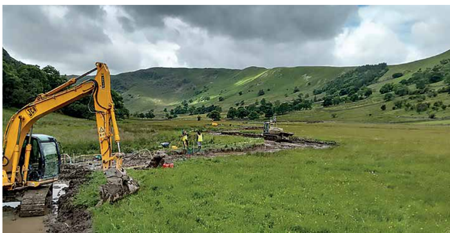
Figure 3. Swindale Beck restoration work in progress.

Previous river restoration schemes had shown that there is little need to do much detailed design work and that once a river is connected into a restored channel, natural processes rapidly take over and the desired in-river features (gravel bars, riffles, pools) all form spontaneously. This approach was taken with the design for Swindale, and contractors were asked to create a simple channel profile based on a basic two-dimensional design.