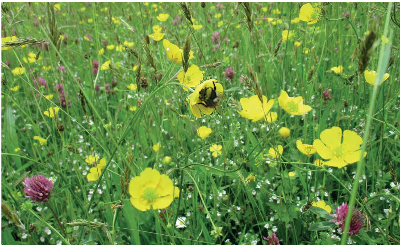
Figure 2. Swindale Hay Meadows.

designated Sites of Special Scientific Importance (SSSI) and Special Areas of Conservation (SAC) (Figure 2). Under RSPB management, with zero fertiliser inputs and carefully timed grazing, their botanical interest has been improving. They are also an important part of the RSPB farming operation, providing winter fodder for sheep.