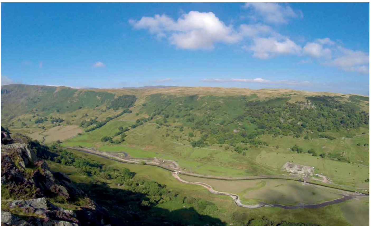
Figure 4. Aerial photo showing the straightened route and the restored route before connection.

The restored channel at 891 m is 140 m longer and around 2 m wider than the old route and, without the levees, is much better connected to the flood plain. In-channel deposition is visibly occurring in several places, which should reduce the quantity of material ending up at the United Utilities intake, saving on maintenance costs. Gravels are naturally sorted within the channel resulting in areas of fine sediment distinct from larger substrate. As the new river beds in, and aquatic organisms recolonise, this enhanced morphological diversity will almost certainly result in the beck having much more wildlife than it has supported for decades. We will be carrying out a range of different monitoring activities