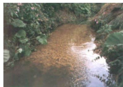
Figure 2: Riffle developed at an identified site as part of rehabilitation works.

In this case the identification process was adapted slightly to concentrate on the needs of fisheries rehabilitation by focusing on in-stream features and by using water quality as an additional criteria. This application comprised relatively low cost rehabilitation works to give substrate, bedform and channel-margin habitat improvements, (see figure 2). The wider aspects of multi-functional integrated management in the Sankey catchment, and the role of geographical information systems, are now being developed in a further Environment Agency (North West Region) initiative.