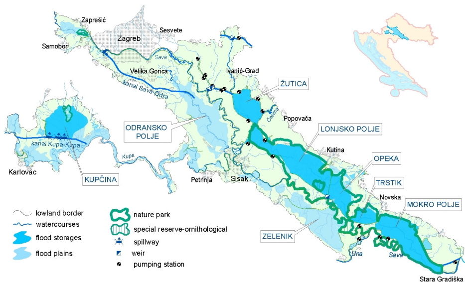
Fig. 1: Location map of the Middle Sava Basin

survival. Parts of the area are protected in accordance with laws and conventions on nature protection (Nature Park and a Ramsar site of Lonjsko polje, a Ramsar site of Crna Mlaka, ornithological reserves of Rakita and Krapje Đol, etc.).