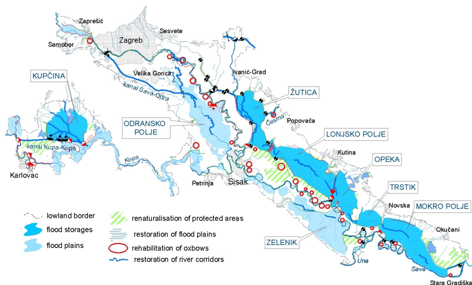
Fig. 4: The Middle Sava solution as proposed by the Environmental Impact Study