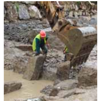
(1) View downstream during construction; (2) Installing tombstones to low stone weirs